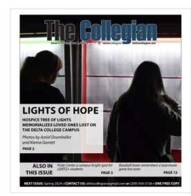
The Collegian - Published De... December 1, 2023