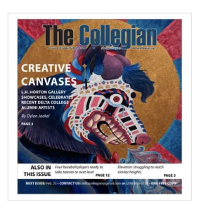
The Collegian - Published Fe... February 1, 2024