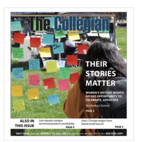
The Collegian - Published Ma... March 28, 2024